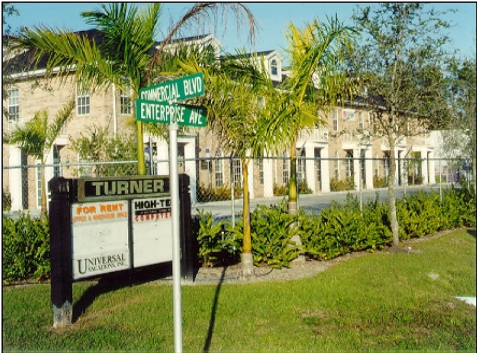
This warehouse - commercial property was designed in conformity with Collier County Landscape Code Regulations.